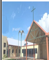
St. John the Baptist

St John the Baptist Church 62 Bowden Street, Glenorchy, 7010